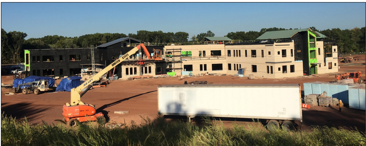
Construction site photo—September 13, 2016