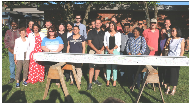
Parents of Student Ambassadors