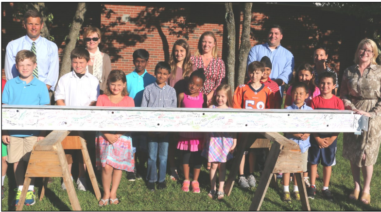
Principals, Student Ambassadors and Superintendent of Schools

The district looks forward with anticipation to the completion of the project and the opening of the new school in August 2017.