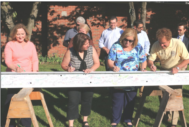
Town Officials Sign Beam